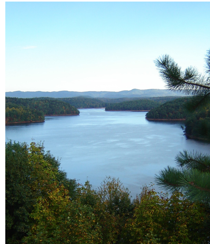
Philpott Lake Overlook